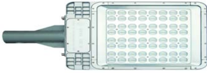
Front (LED Street Light 120W)